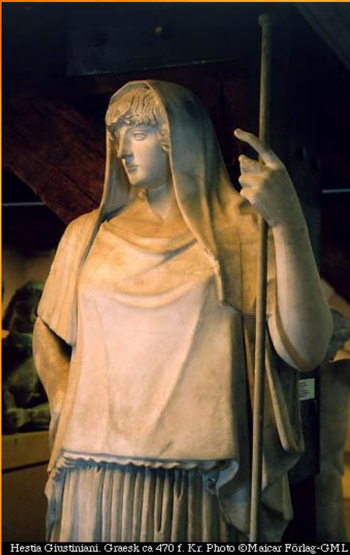
Hestia Giustiniani. Graesk ca 470 f. Kr.